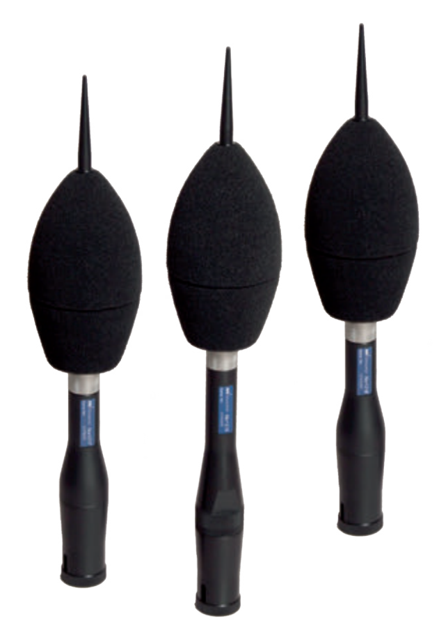
Nor1216, Nor1217 and Nor1218 outdoor microphones.

The Nor1506B is a waterproof portable case with space for the sound level meter, two 22Ah Li-Pol batteries for powering the sound level meter and 3G/4G modem. Several options may be added such as the detachable microphone rod. The Nor1531 is a weather protected enclosure for permanent installations. It features a 2,2Ah backup battery and mains power with space for the sound level meter and optionally modem and power for weather station.