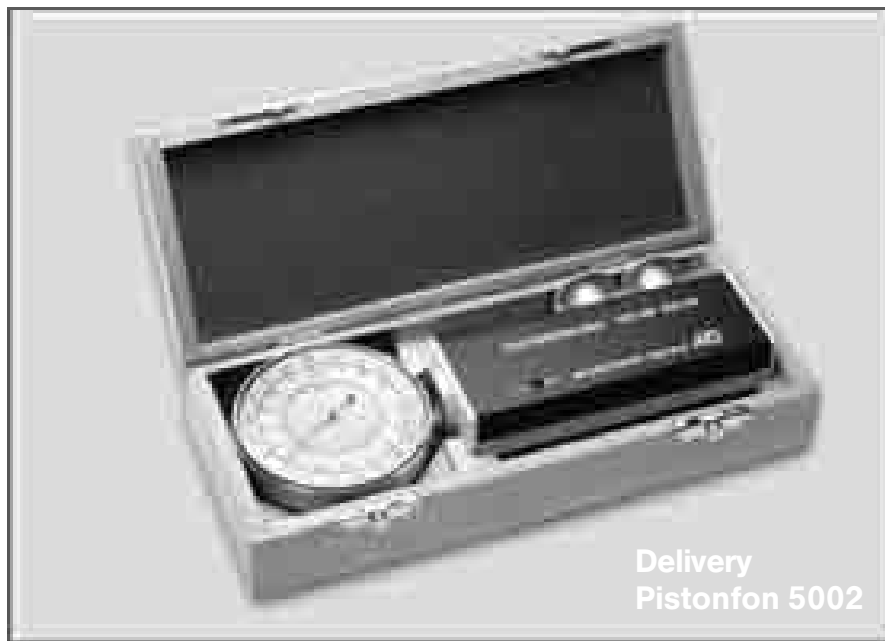
Delivery Pistonfon 5002

Nominal sound pressure level 124 dB Nominal frequency 250 Hz Tolerance of sound pressure level \pm 0,3 dB Tolerance of frequency \leq 0,1 % Total harmonic distortion \leq 3 % Ambient conditions: Pressure 850 hPa ... 1080 hPa Temperature, operating - 10°C ... + 50°C Temperature, storage - 40°C ... + 70°C Relative humidity max 95 % Power supply Batteries: 7 x 1,5V IEC Type LR6 ("AA" size) or external 8 V ... 45 V = Livetime with alkaline batteries at 20°C > 30 h Degree of protection IP 30 Dimensions 64 mm x 48 mm x 180 mm Weight with batteries 670 g complete with wooden case 1530 g